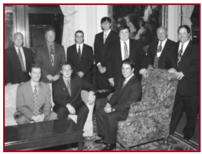
Brothers from the Omicron chapter outnumbered all other chapters at Psi Upsilon's 162nd Convention Awards Banquet in Chicago.